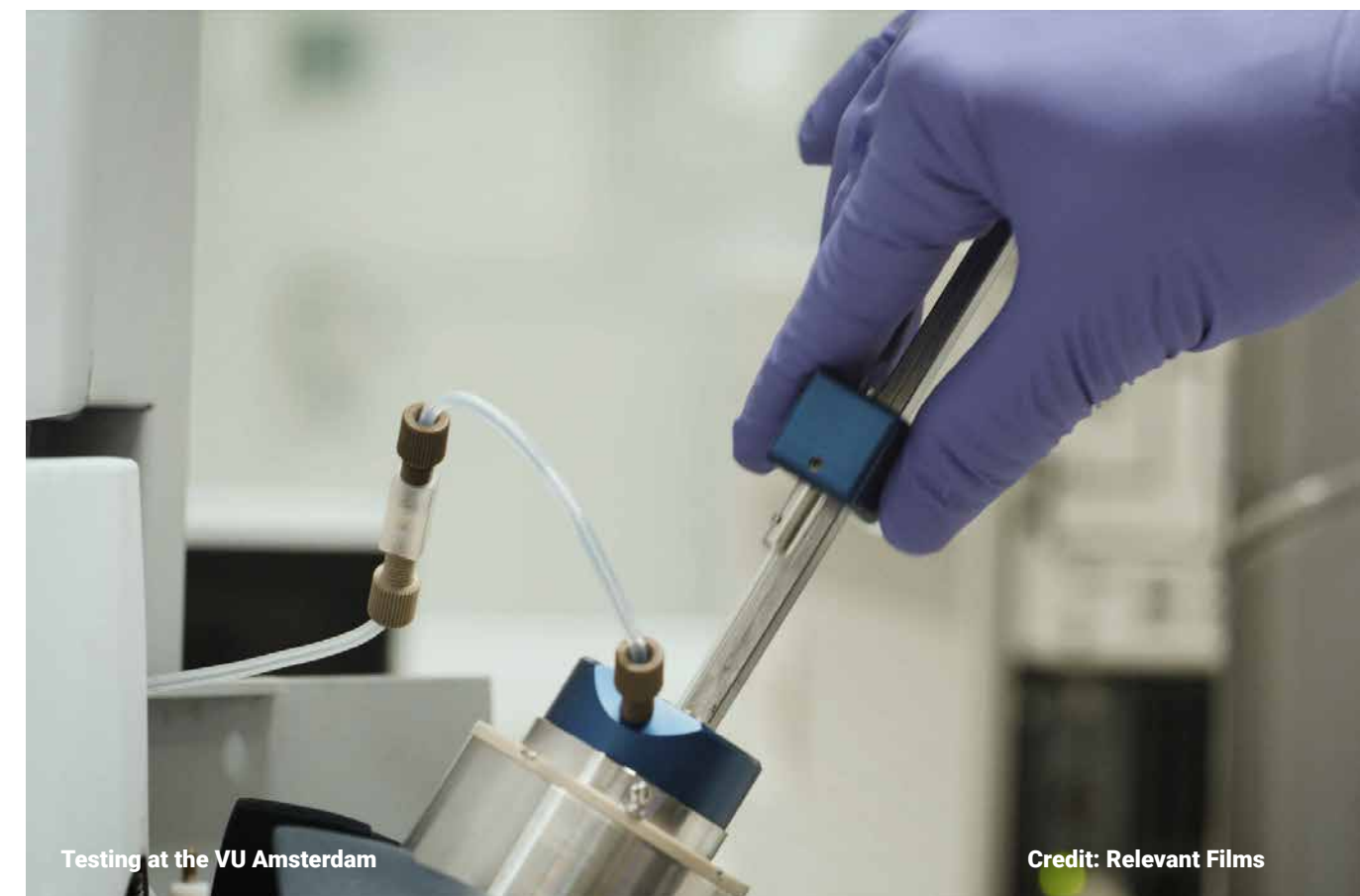
Testing at the VU Amsterdam

After presenting the results of the testing, this chapter will take a more detailed look at each company, the toxic substances found in their carpets and how these compare to their own commitments or any certification schemes they are part of. Although testing implemented for this report cannot provide any concrete conclusions on the health effects of exposure to this carpet, it is an indicator of the presence of certain chemicals in carpets sold in the EU. The authors of this report recommend further research to establish these links.